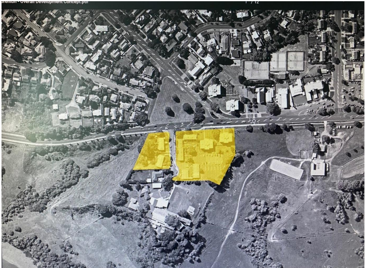
Above photo overlay is the current land envelop of Kainga Ora/HNZ